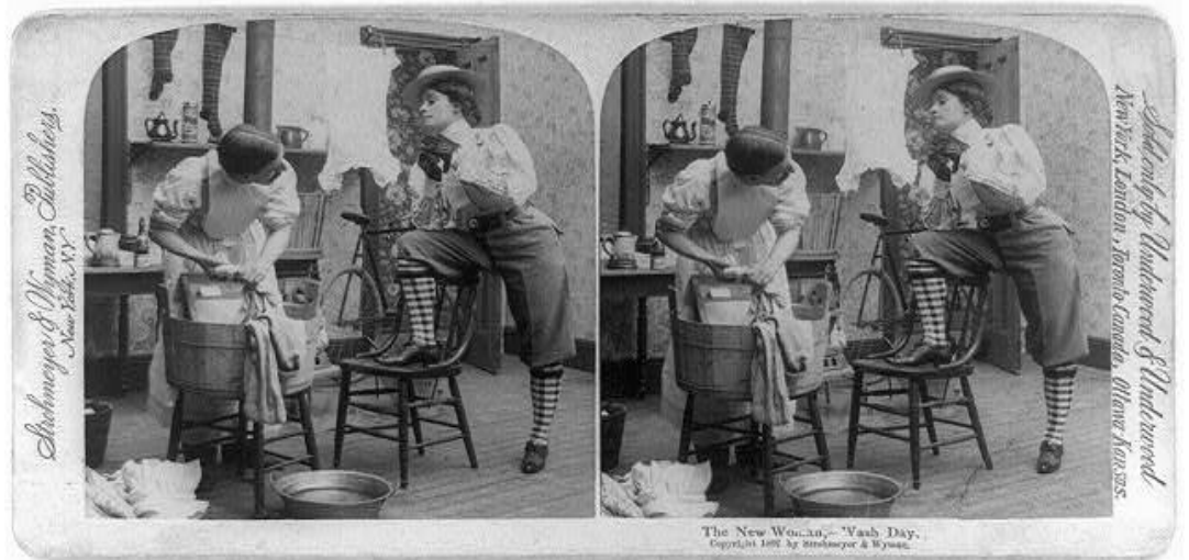
The New Woman -- Wash Day (1897)